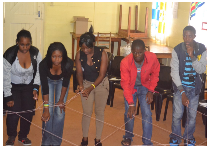
Maitland High School training for facilitators: showing the inter-connectedness of our actions

The six schools in which QPC is working are in areas where gangs are active, unemployment high and drug use and trading widespread.