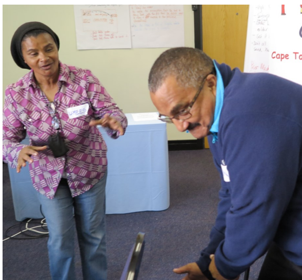
Role playing conflict during peer mediation training of trainers