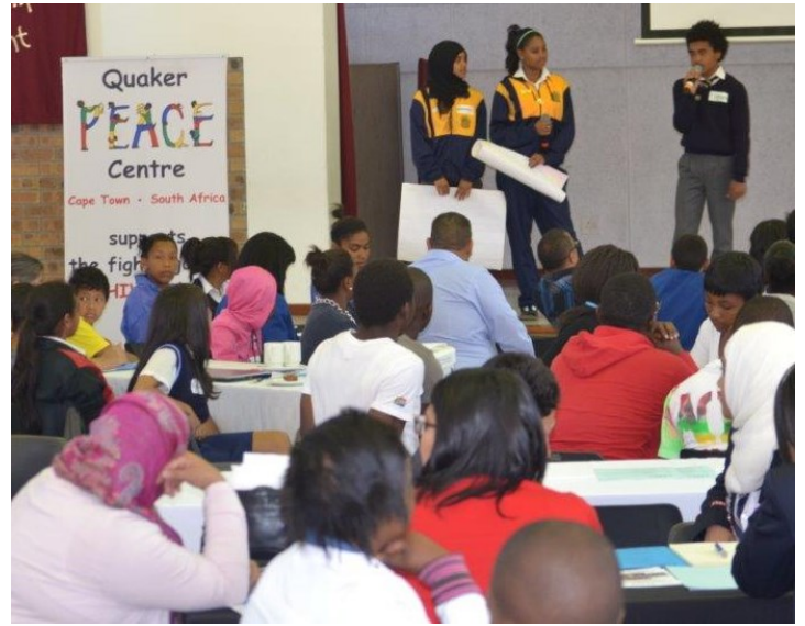
Pupils from Crestway High presenting at the Lekgotla

In 2014, initial activities in four schools culminated in a gathering during which members of the PAFOVs presented their diagnosis of the main problems of poor relationships, bullying and violence in their schools and identified some possible solutions. The gathering was addressed by external speakers and attended by staff of the MSED, principals and teachers. Participants were encouraged to share experience and agree on a set of recommendations for action at MSED and school levels. QPC facilitated the event and has been commissioned to prepare a report which will be circulated to other schools and education districts.