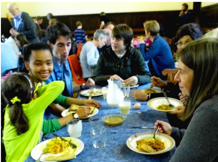
Selly Oak Local Meeting's curry evening to raise funds for QPC

Contact the convenor, Carole Rakodi, at rakodiqpc@talktalk.net or 02920 514701